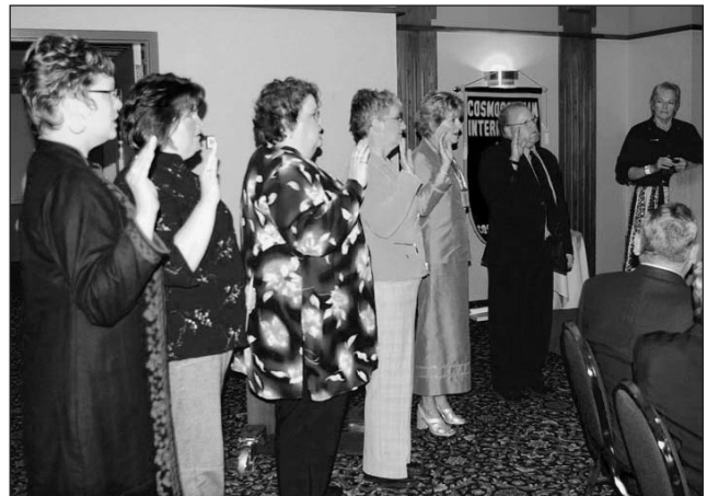
Charter Club members being sworn in...welcome to Cosmopolitan International the Club that fights Diabetes